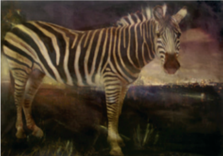
Rodney Pople Zuri , 2010 oil and photographic media on linen