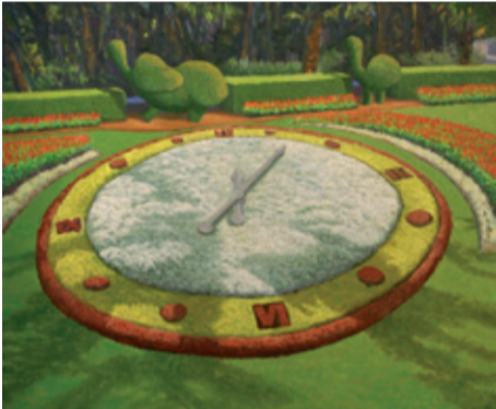
Leo Robba Flower Power/Taronga Zoo , 2010 oil on canvas