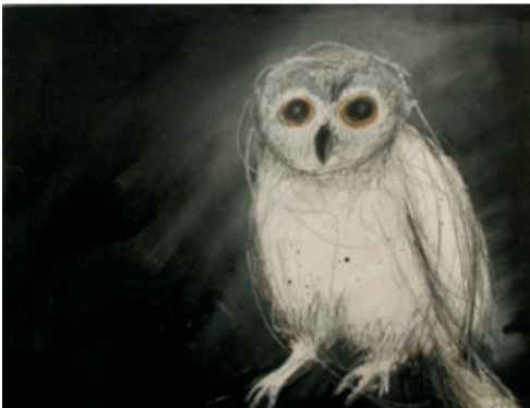
Amanda Penrose Hart Untitled , 2010 mixed media on paper