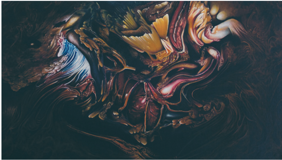
TOP Colin Rosewell Mechanical Intervention 2010 oil over digital print (prototype) on canvas 81 x 146cm