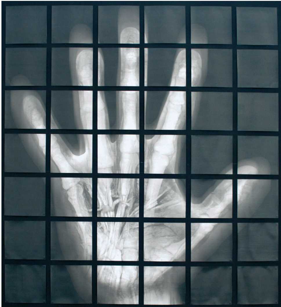
ABOVE Colin Rosewell Haptic Vision: Expanded (installation view) 2012 digital ink-jet print on papers dimensions variable