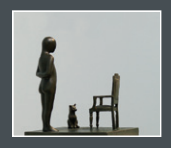
Peter Tilley He Who Hesitates 2008 patinated bronze 17.5 x 14.5 x 14.5 cm

The figure which sometimes appears in Peter's work seems finds himself in a different situation with a selection objects from a lifetime of habits and pastimes. The placement of items creates a tension, as the unusual and everyday merge to render the familiar as strange.