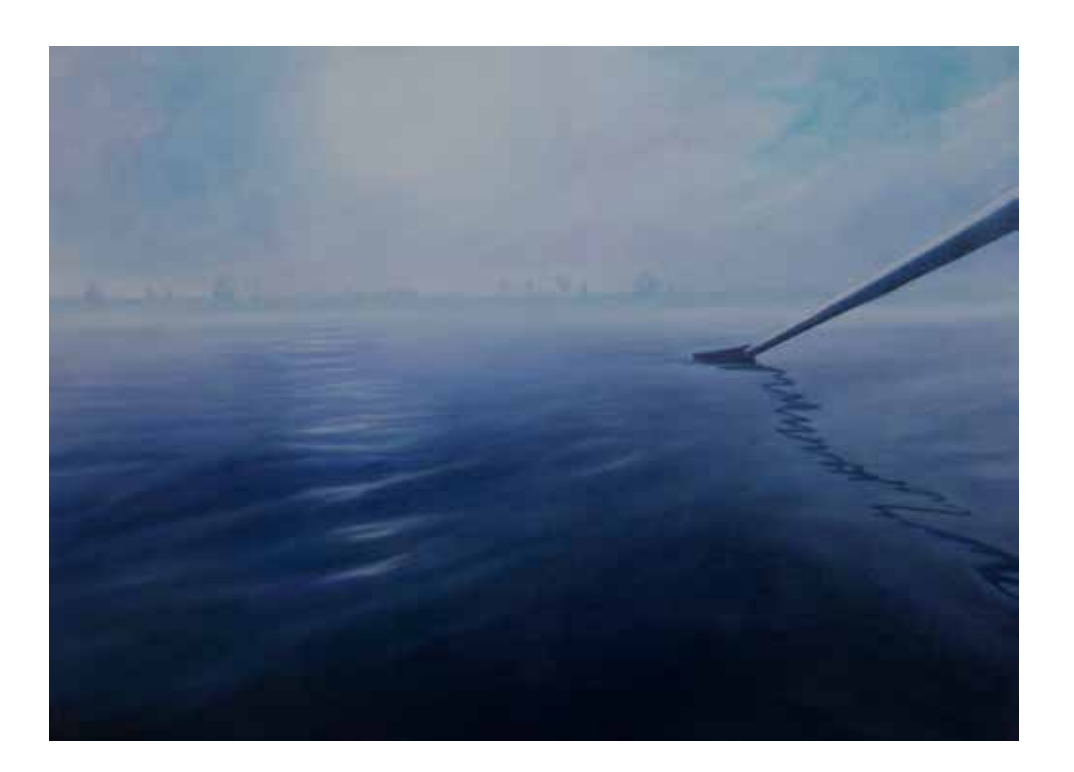
....as I cast my eyes I see what was, and is, and will abide: Still glides the stream and shall forever glide....

Endurance, 2015 oil on belgian linen 90 x 120cm