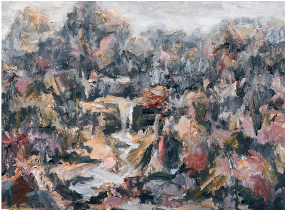
John Barnes Towards the Source 2009 oil on paper 55 x 75cm