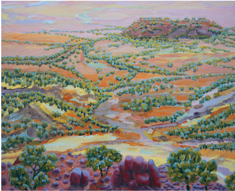
John Barnes Meeting Place 2008 acrylic on plywood 60 x 74cm

“ Can the materials and processes of landscape-focused studio research, structured on an experiential foundation, act as a portal of connection with nature for an arguably disconnected humanity? ”