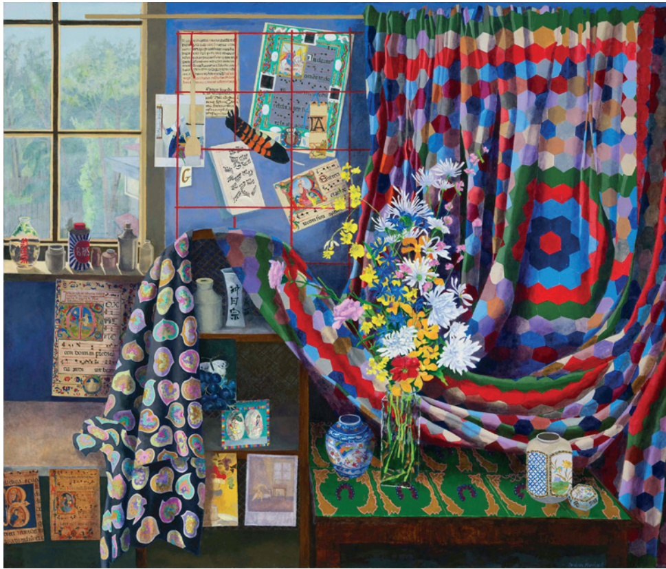
Graham Marchant Quilts, Silks and Manuscripts 2007/8 oil on canvas 119 x 139cm