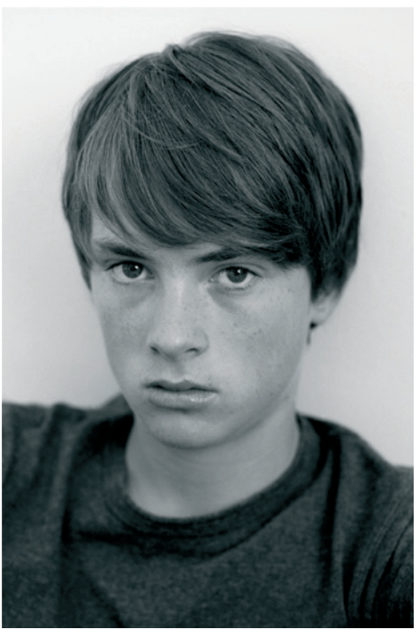
Dene Hawken left Untitled III right Untitled IV 2004-10 film based digital output 110 x 76.5cm

the art of entertaining culture continues until 12 February