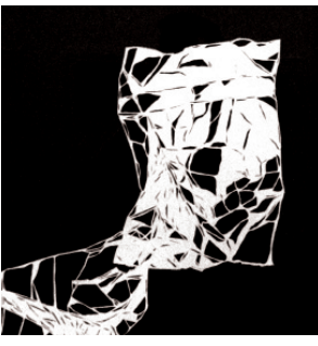
of Brisbane's Echoes of Home: Memory and Mobility in Recent Austral-Asian Art.