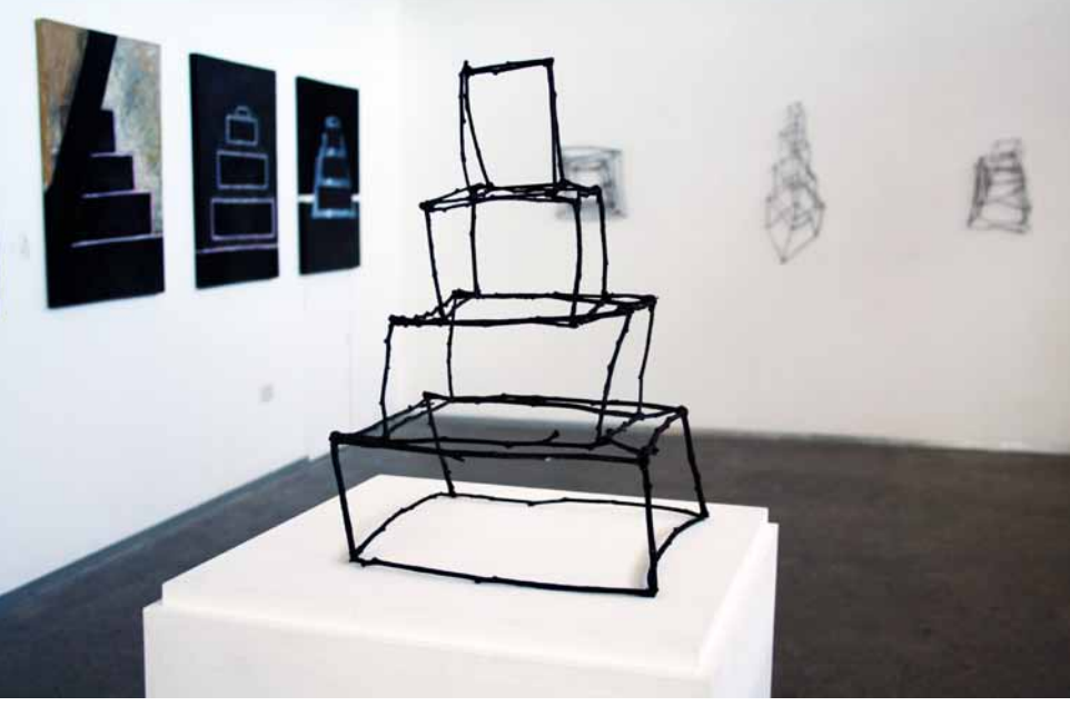
Cate McCarthy 24 Maps of Life 2009 ochre, tree resin, graphite, watercolour, charcoal on canvas, 15cm x 15cm each

The work in this exhibition is about the process of becoming. It examines how memory, knowledge and connection are imbued in place and how one can closely relate one's paintings and drawings to a sense of place and country by the use of materials such as ochres and the use of strong simple abstract forms.