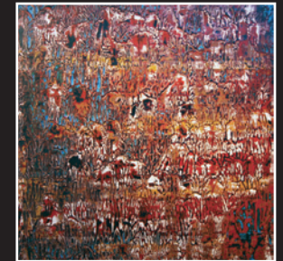
ABOVE TOP Aubry James Byrnes Untitled 2012, oil on timber, 25 x 25cm